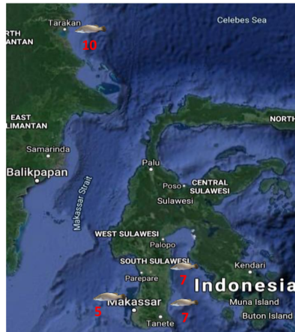
Figure 1. Sampling localities (shown as fish symbols, with number of specimens) of four Asian seabass populations in the Wallacea Region from Bulungan in North Kalimantan to the Gulf of Bone